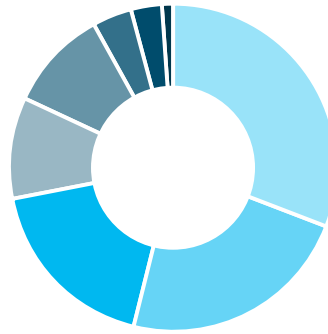
CURRENT INVESTORS BY TYPE

By committed capital.